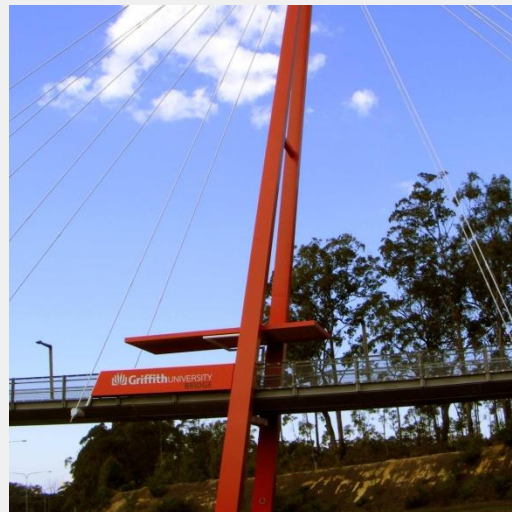
Griffiths University bridge primed with Dulux Zinacode® 402

For more information, please contact the contact the Dulux Protective Coatings Technical Consultant in your state.