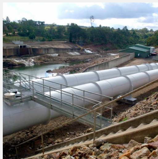
Glenmaggie Pipeline cathodically protected with Dulux Zinacode® 402