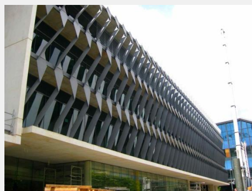
The sun screens of the ABC Building Brisbane were primed with Dulux Zinacode® 402