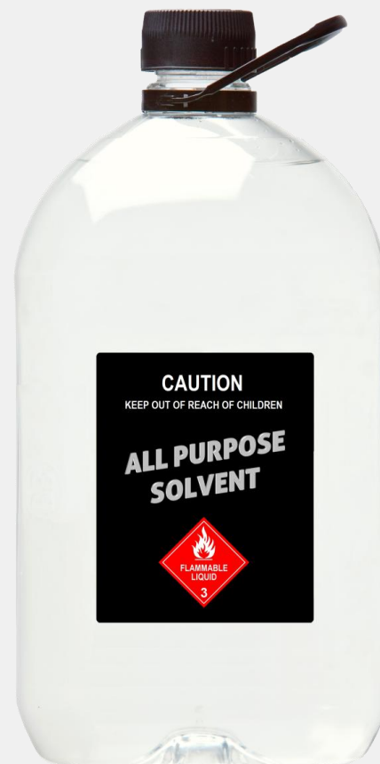
Solvents have a wide range of uses around the home and in industry, but must be used sparingly and with caution.

For example, fast dry time is desirable when spraying to reduce turn-around time, but can be a hindrance when brushing or rolling due to reduced wet edge and the appearance of excessive brush-marks and "picture-framing" (the appearance of a visible ridge around the perimeter of a wall where the brushed-in sections overlap the roller-applied sections).