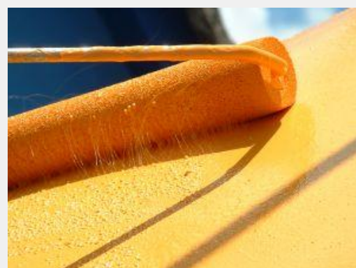
Without a solvent that extends drying time, paint dries too quickly during application, and becomes too thick and stringy to allow a good finish.