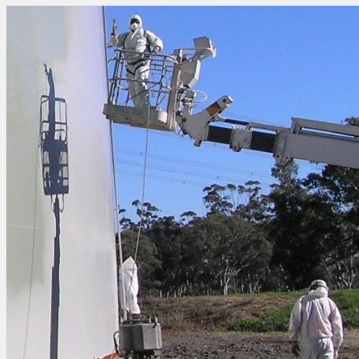
Safe handling of isocyanates always matters, even in well ventilated situations.