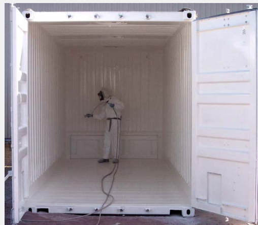
Enclosed environments require special attention to ventilation.

Unless another technology product is available that can deliver better performance and offer equivalent case histories, is demonstrably less hazardous, and is not cost prohibitive, there is no need to switch.