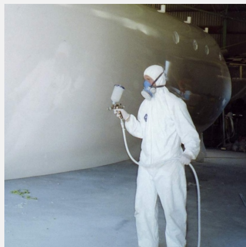
Safe handling of isocyanates are described in Safe Work Australia's website .