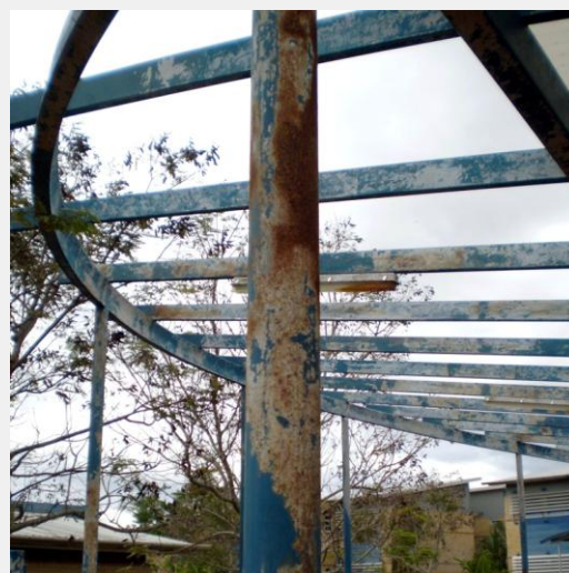
“Duplex systems” (HDG and paint) in coastal environments often fail within a few years.