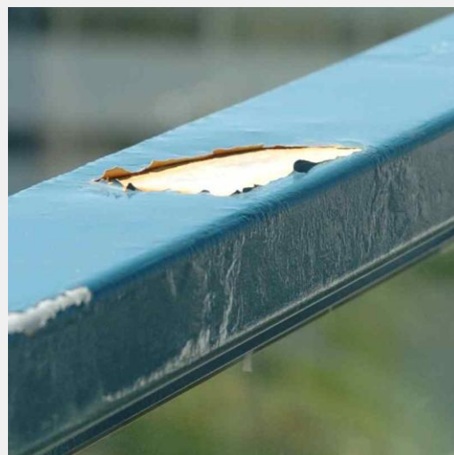
Osmotic blistering is identified by broad areas of blistering. Often the blisters contain water.