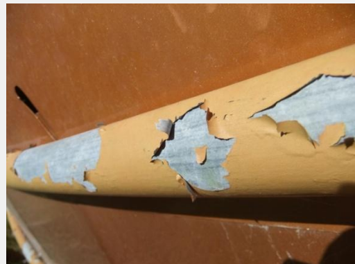
Poor surface preparation and primer choice were factors in system failure