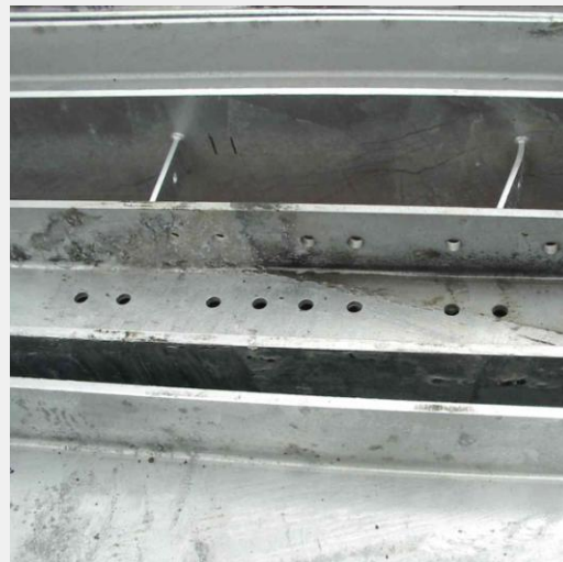
HDG process can produce wide variations in product quality